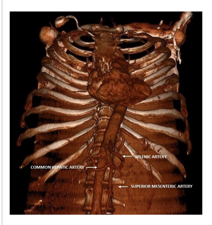
FIGURE 1 - Angio-CT

due to obstructive jaundice. A preoperative contrast CT scan was performed showing partial tumor response, with close contact with the hepatic artery without encasement (<180°). Interestingly, an anatomic variation of the hepatic artery originating from the superior mesenteric artery was found (figure 1).