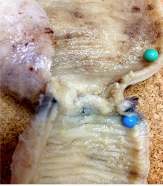
FIGURE 2 – Intraoperative findings and surgical specimen reveal single stricture with dilation of the small bowel upstream.