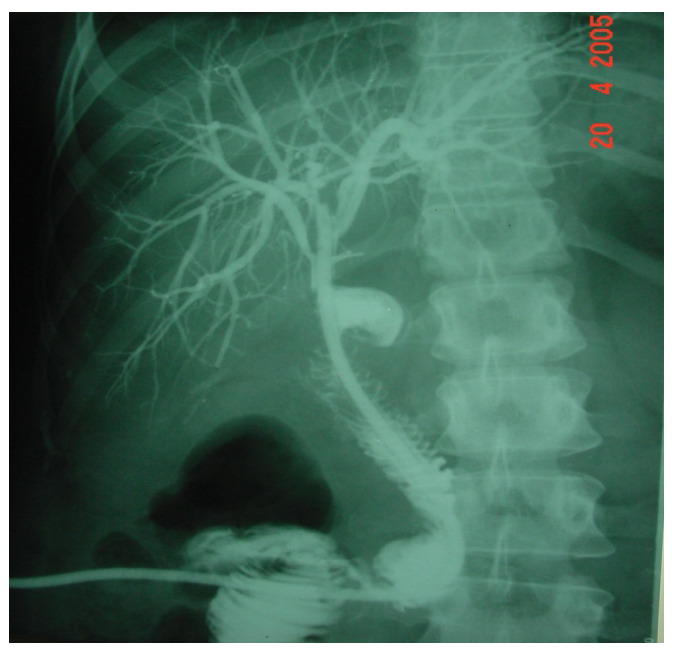
Fig. 5 Hepatico-jejunostomy

LC is currently regarded as a safe intervention for simple gallbladder lithiasis and in acute cholecystitis(11). Bile duct injuries remain the most feared and