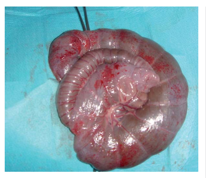
Figure 1. Caecal and sigmoid abrasions after traumatized serosa with punctiform bleeding